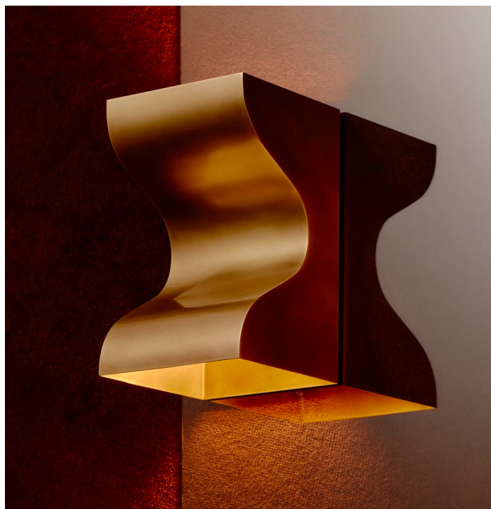
Buckle Sconce - Brass by Völker Haug Studio.