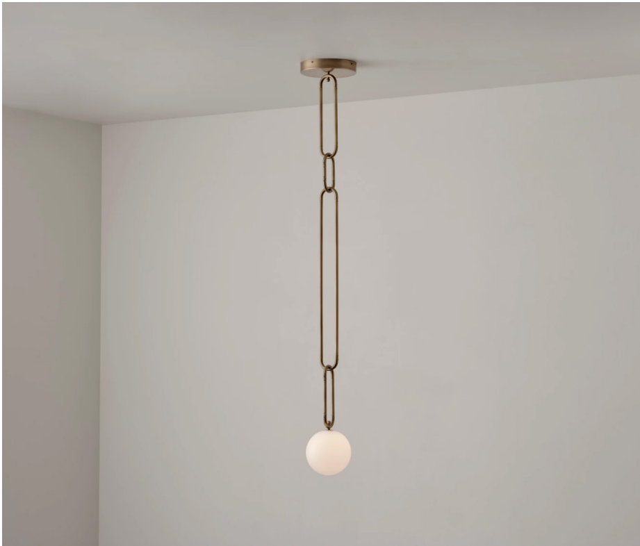
Chain Chain Chain pendant shown in Bronzed finish.