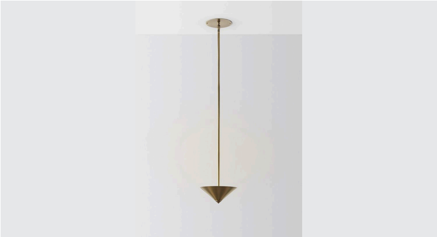
Drop Stack 1 shown in Aged Brass finish.

stahlandband.com info@stahlandband.com 424.228.4134