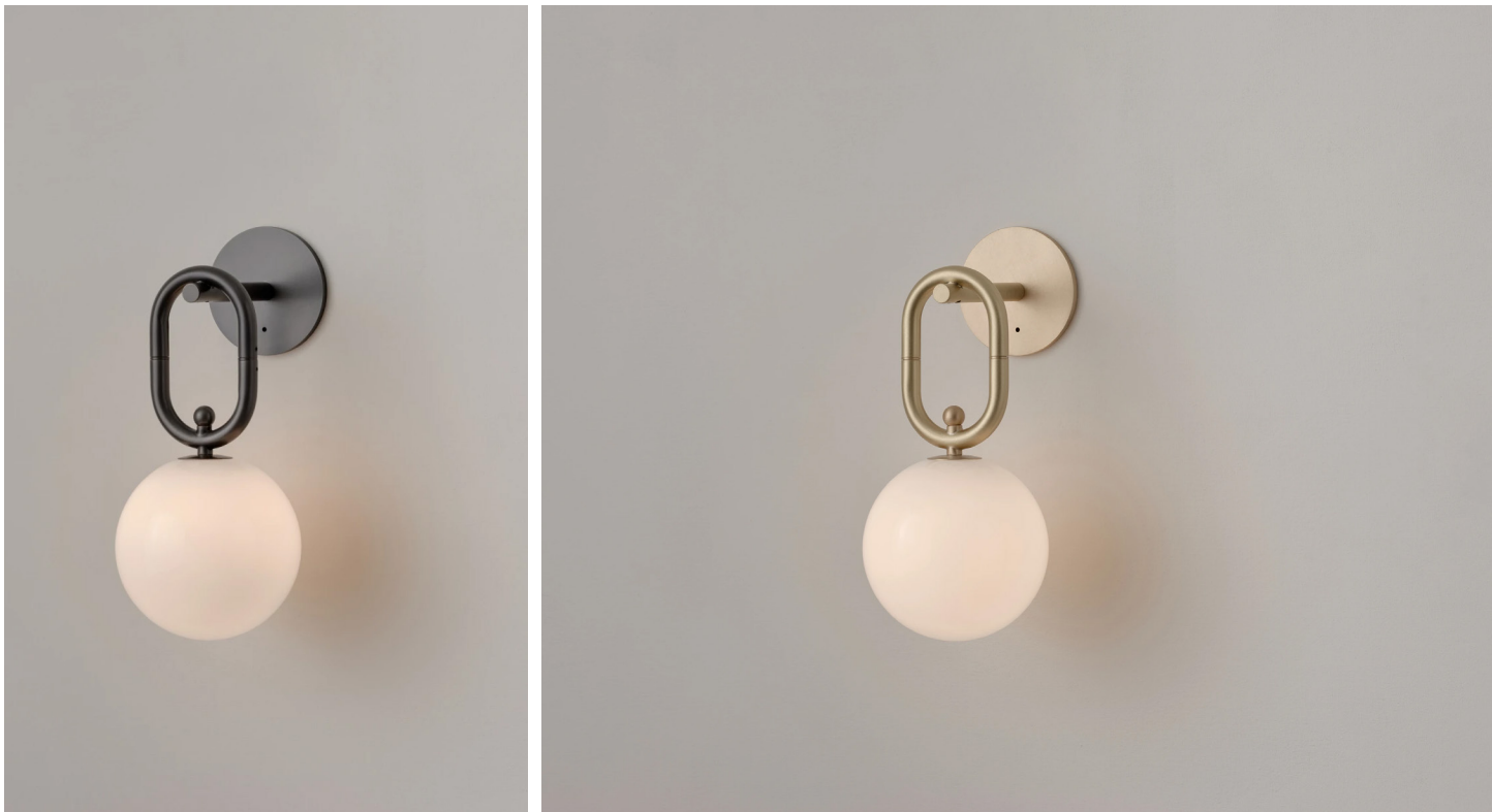
Missing Link shown in Black (L) and Aged finish (R).

stahlandband.com info@stahlandband.com 424.228.4134