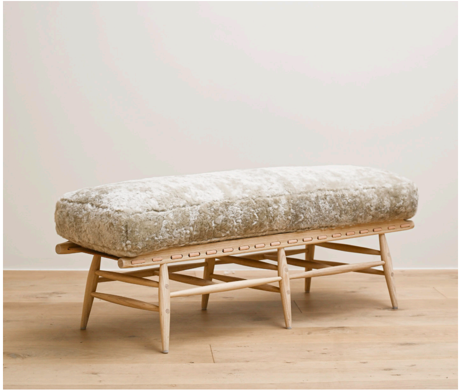
Strapping Bench shown in White Oak with Shearling.