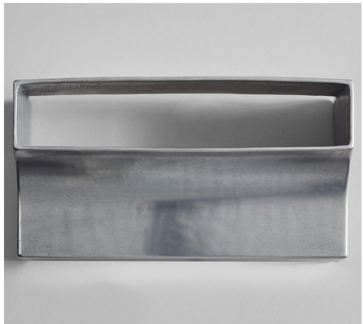
Scoop Wall Light, Aluminium.