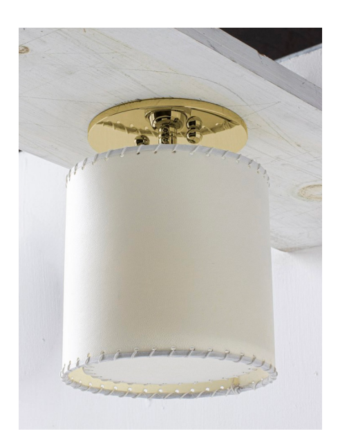
Series 02 Small Flush Mount- Polished Unlacquered Brass- Goatskin Parchment.