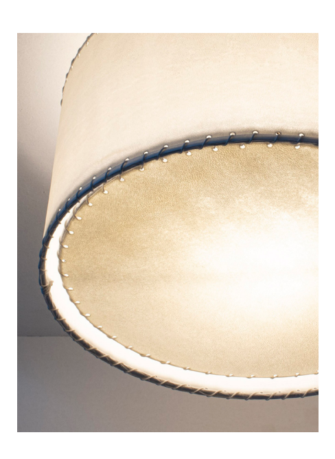
Series 02 Small Flushmount - Solid machined brass, hand-stitched goatskin parchment shade with diffuser.