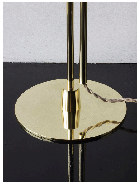
Series 0 Table Lamp - Solid machined and sculpted "smoke" acid patinated brass base, hand-stitched goatskin parchment shade, and hand-dyed braided cotton cord.