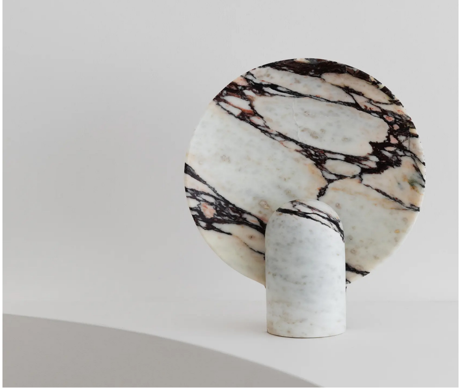
Surface Sconce in Bronze (L) & Calacatta Viola (R)