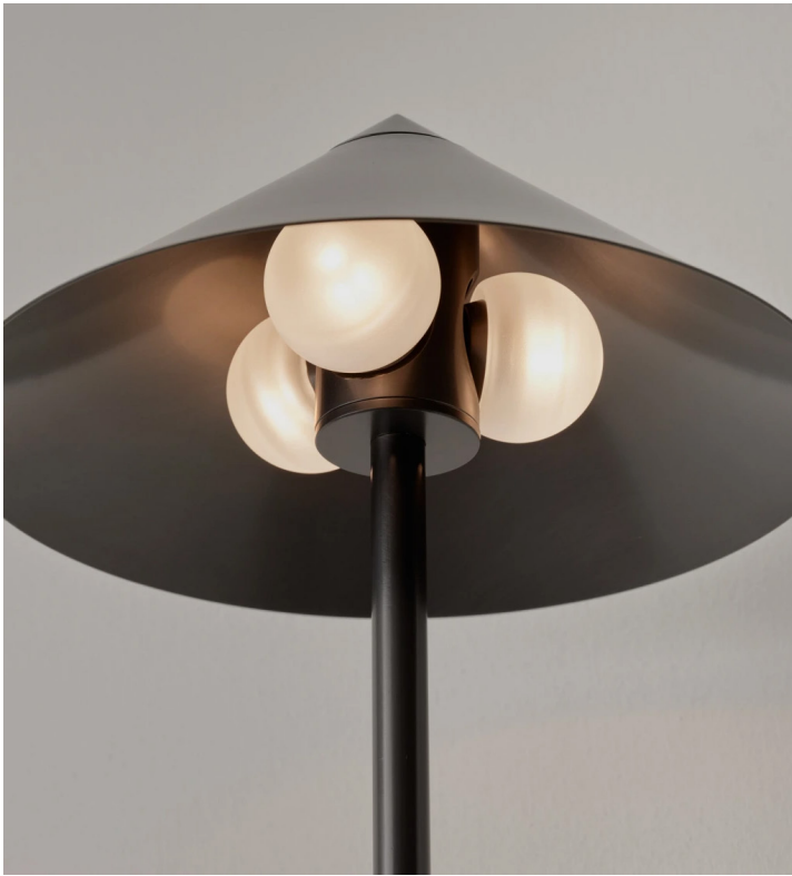
Wall Stack Up (L) and Wall Stack Down (R) shown in Black Brass finish.