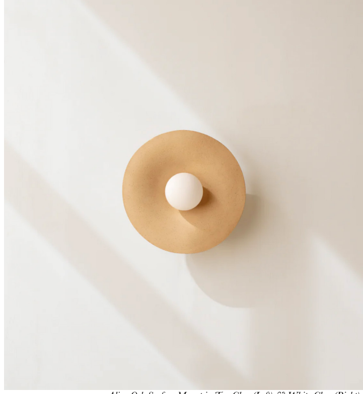
Alien Orb Surface Mount in Tan Clay (Left) & White Clay (Right)