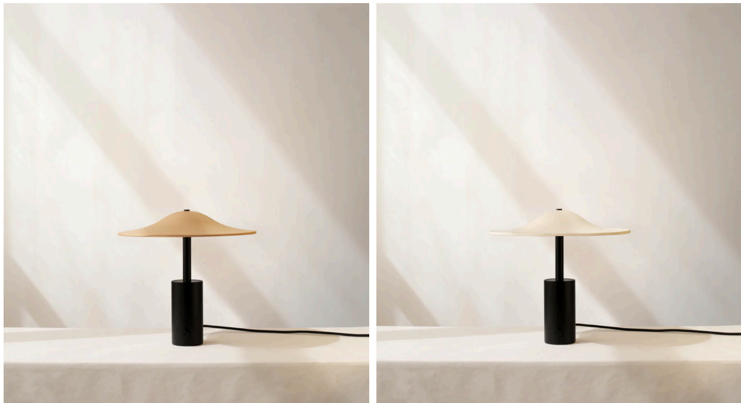
Alien Table Lamp in Tan Clay (Left) & White Clay (Right)