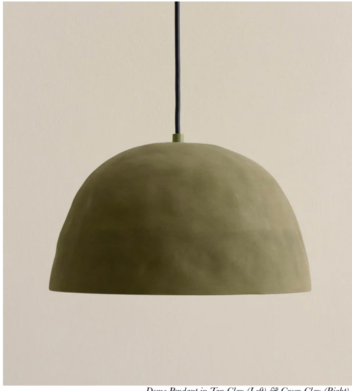
Dome Pendant in Tan Clay (Left) & Green Clay (Right)