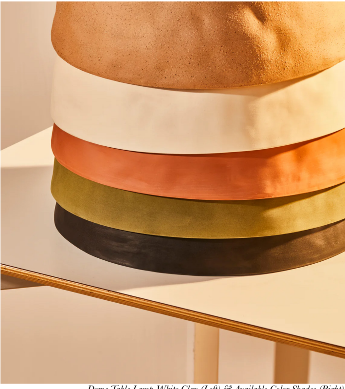
Dome Table Lamp White Clay (Left) & Available Color Shades (Right)