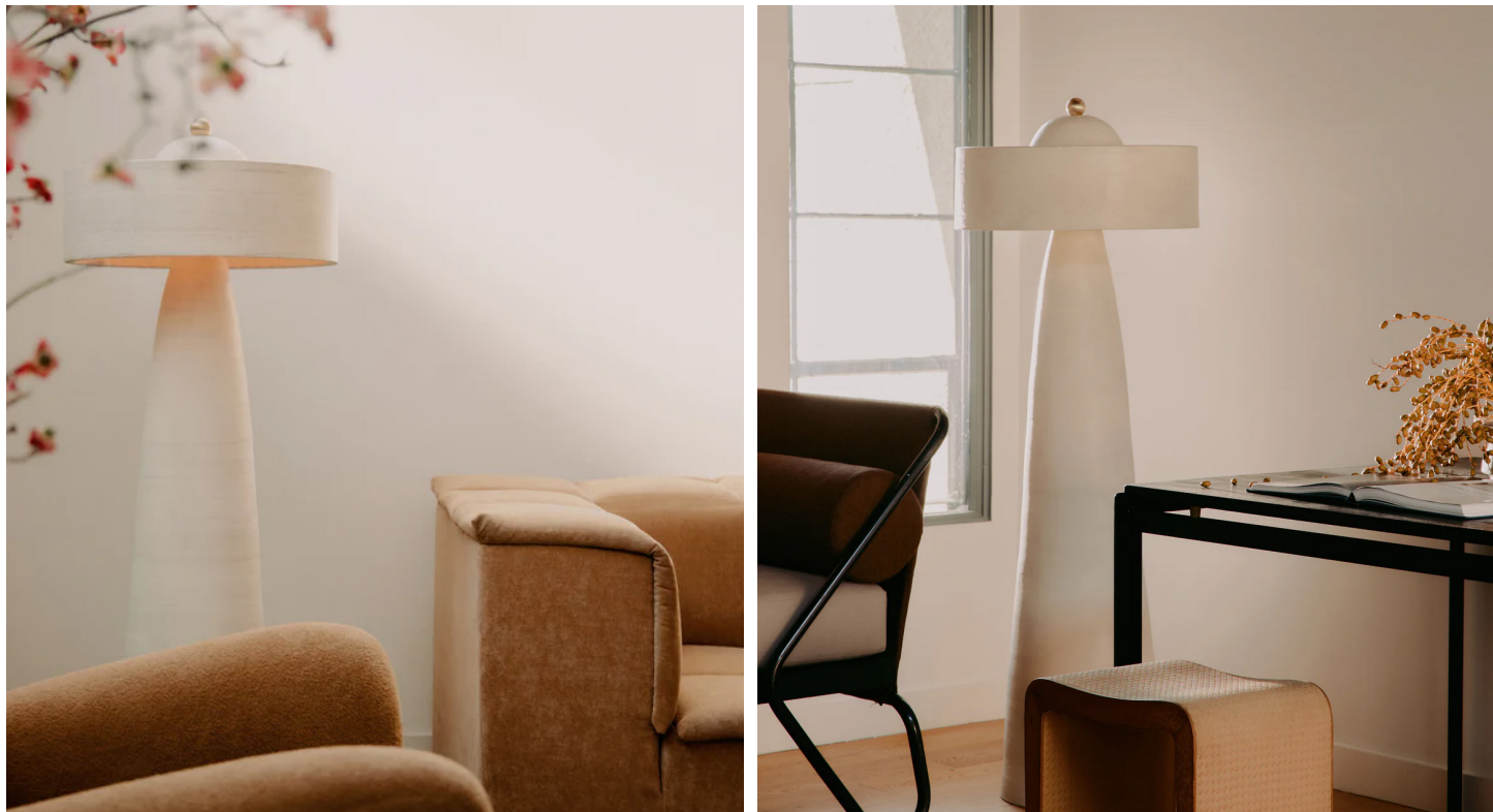
Helena Floor Lamp in Stone & Brass.

stahlandband.com info@stahlandband.com 424.228.4134