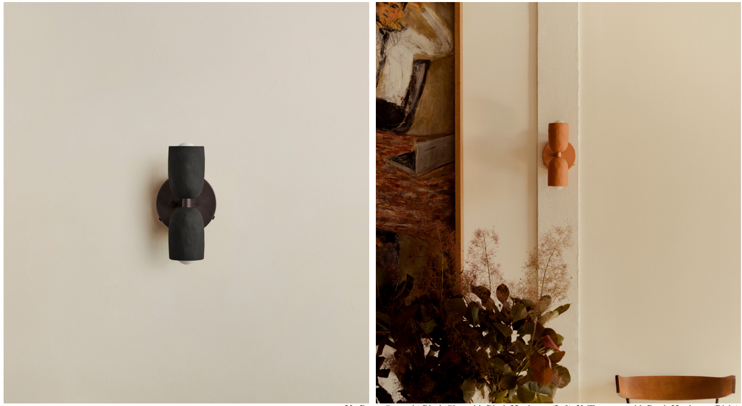
Up Down Sconce in Black Clay with Black Hardware (Left) & Terracotta with Peach Hardware (Right)

STAHL +BAND stahlandband.com info@stahlandband.com 424.228.4134