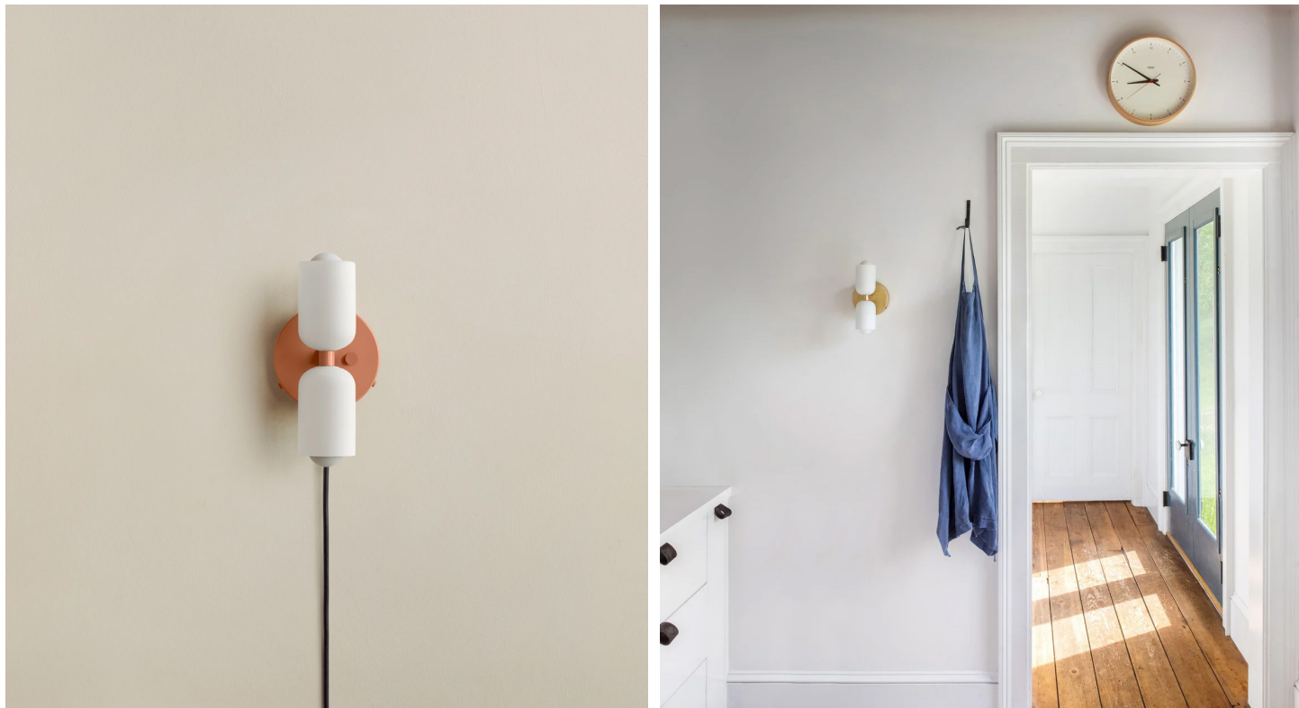
Up Down Sconce Glass in Peach (Left) & Brass (Right)

stahlandband.com info@stahlandband.com 424.228.4134