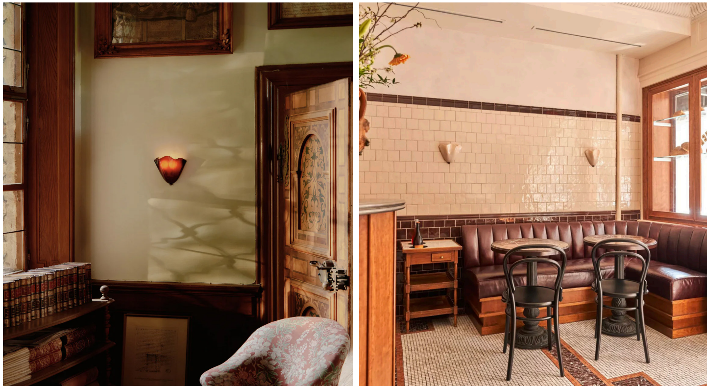
Vera Sconce in Cherry (Left) & Almond (Right)

stahlandband.com info@stahlandband.com 424.228.4134