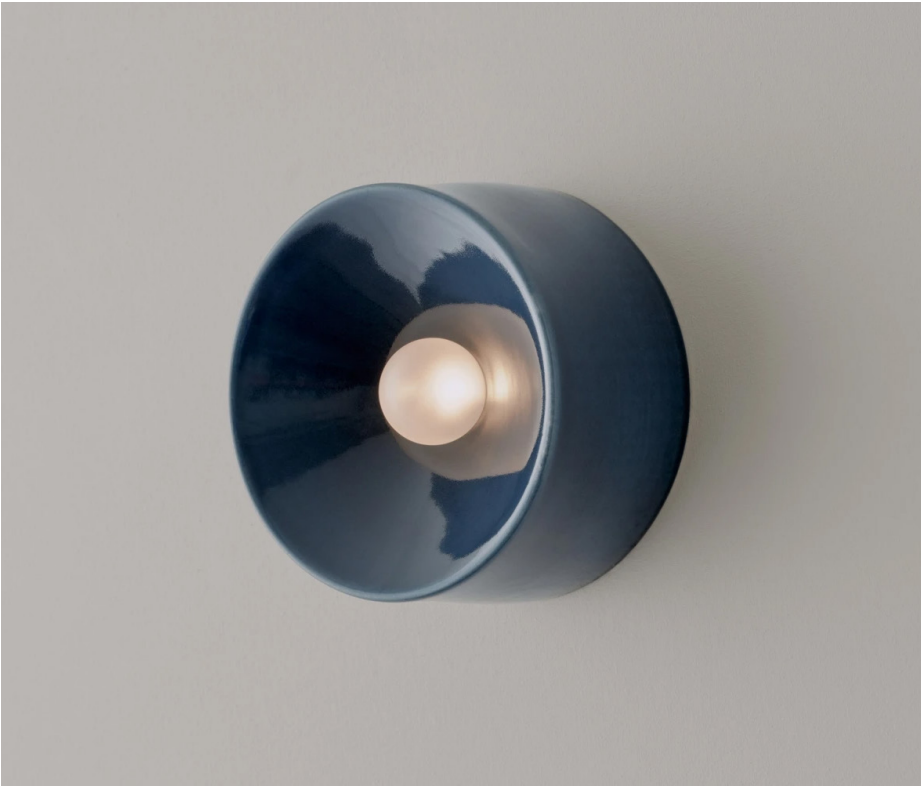
Ceramic Anton Micro in Brown Glaze (L), Ceramic Anton Mini shown in Blue Glaze (R).