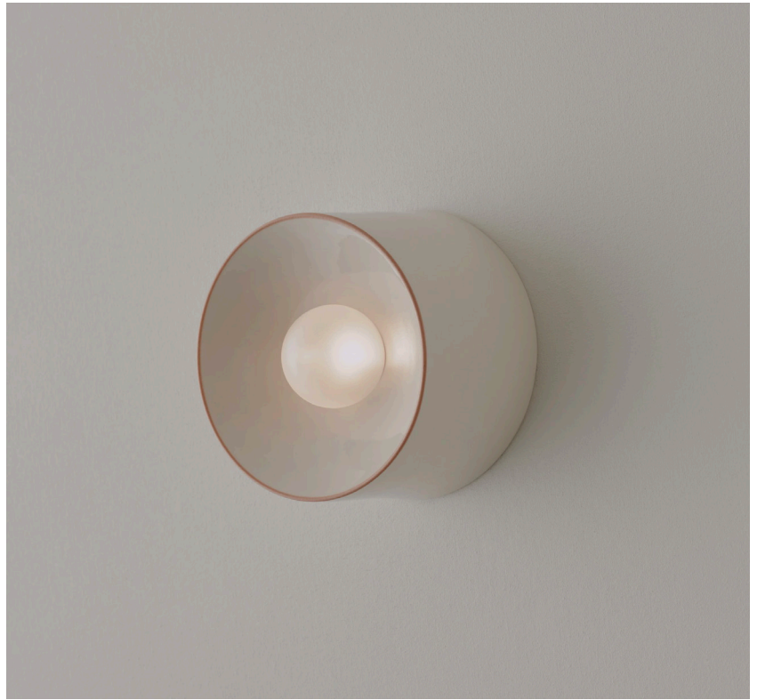
Ceramic Anton Mini with Charcoal Pinstripe (Left) & Tan Pinstripe (Right)