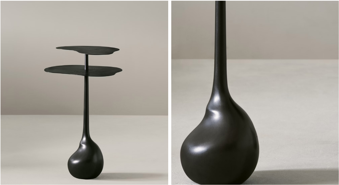
Drive Side Table by Veermakers.