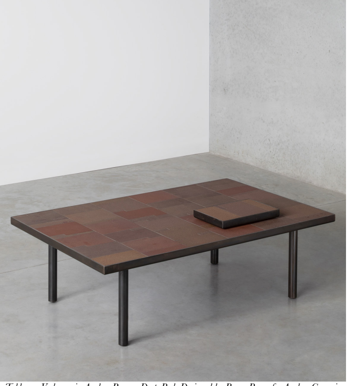
Tableaux V shown in Anchor Process Deep Red. Designed by Bruce Rowe for Anchor Ceramics.