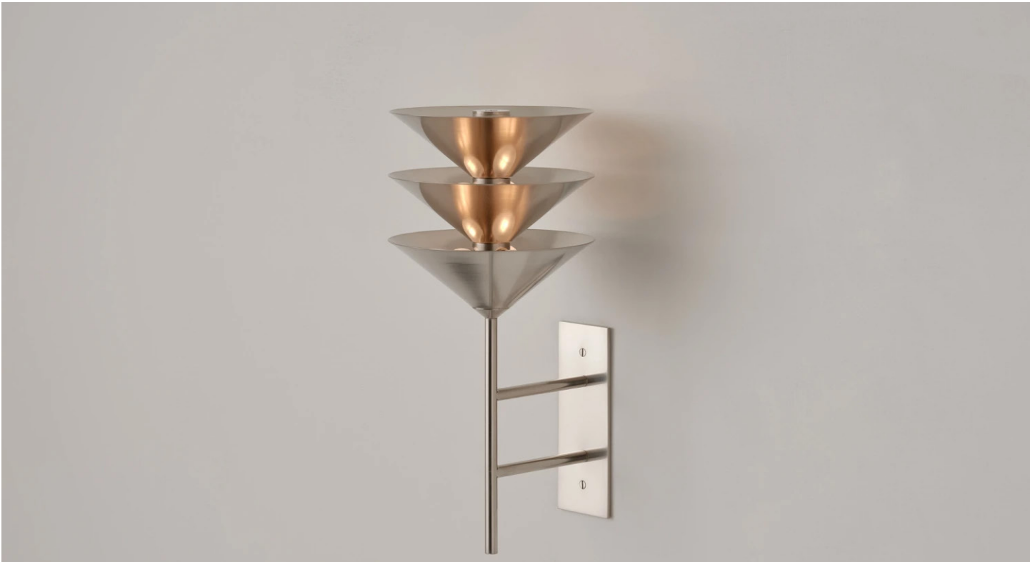
Wall Stack 3

stahlandband.com info@stahlandband.com 424.228.4134