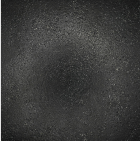
Leathered Absolute Black